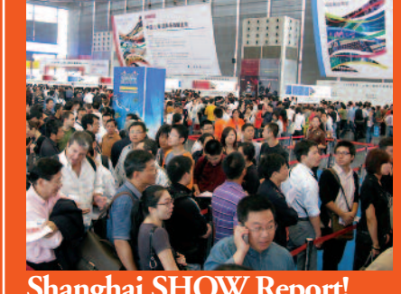
Shanghai SHOW Report! You never seen anything like Music China, the #1 music expo in the East.

All gear, all the time. bassgearmag.com Issue 2